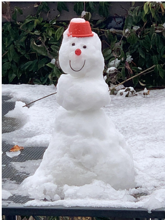
Steve the Snowman Before